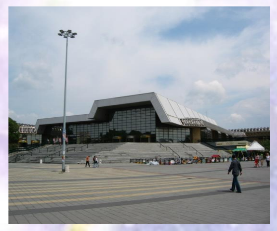
Sport centar Vojvodina Competition hall – 2800 m2 High 16 m, 3 warming up carpets

Official photographer, live stream and online results will be available.